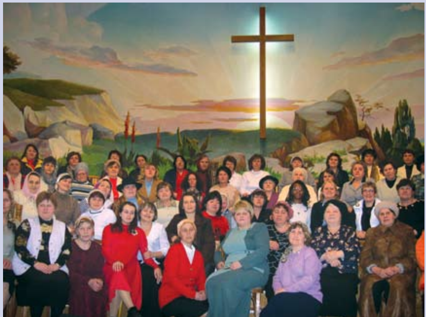
Ukraine Women's Conference, March 2006

hope and healing to other women who were broken. What a testimony of God's redeeming love!